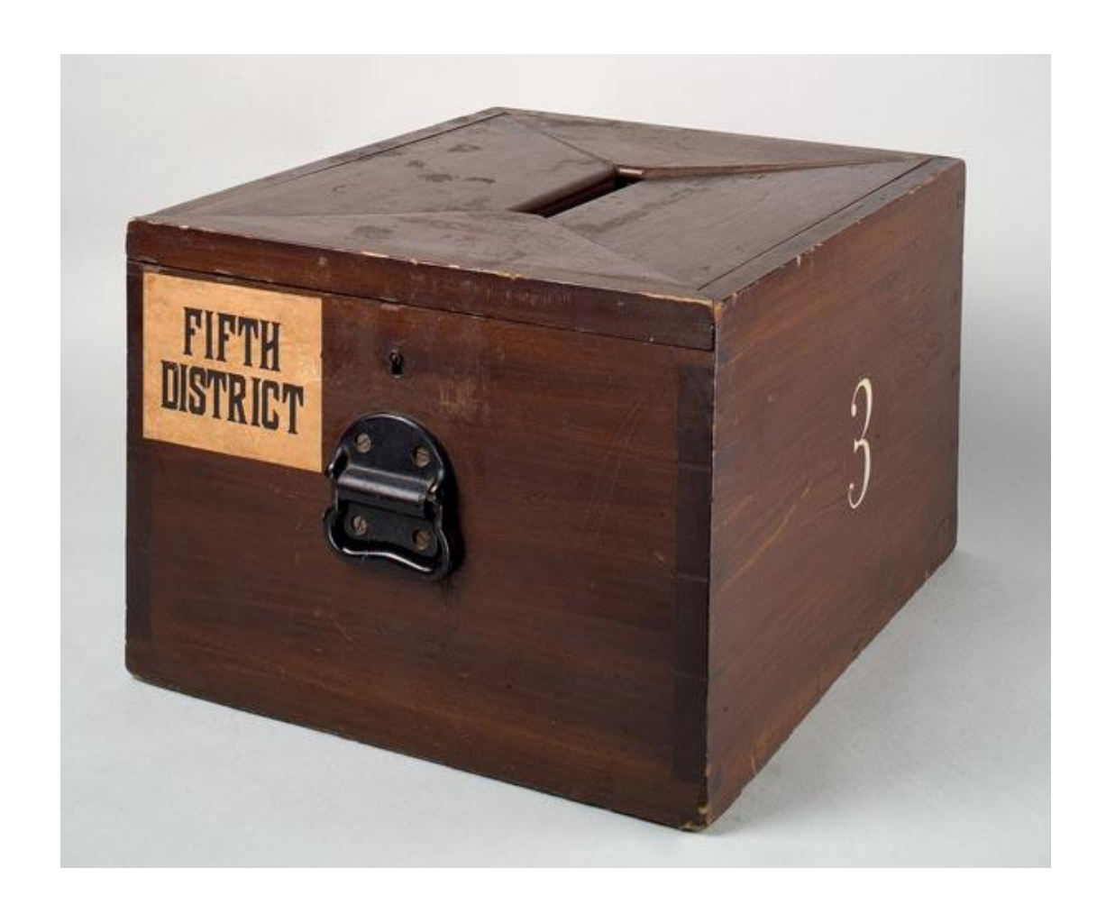
Choosing to Bless